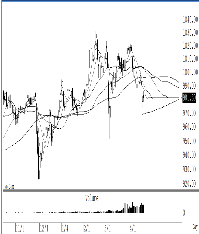
S50M22 (Close 981.30 Chg 2.90)