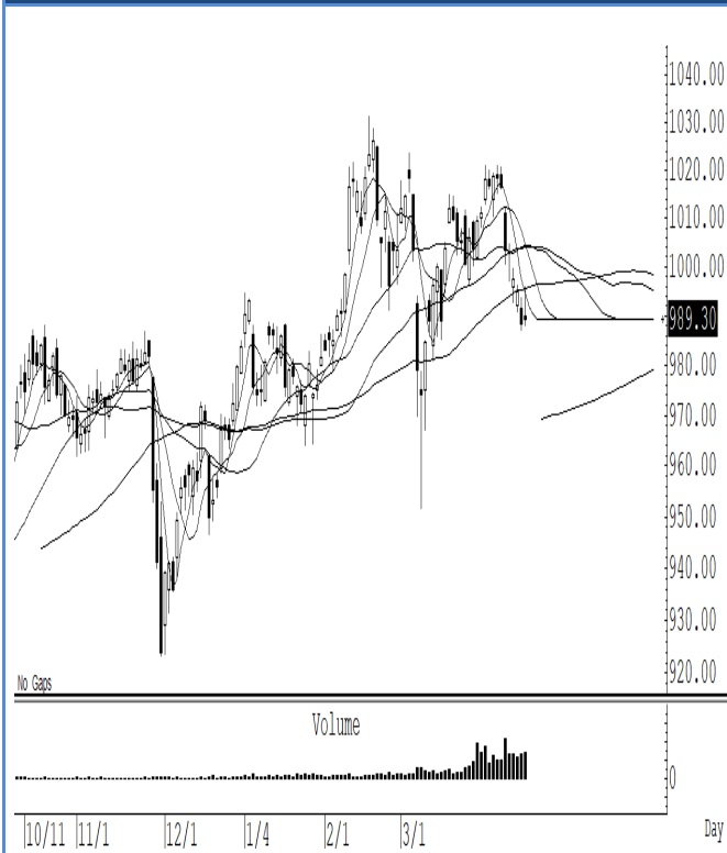
S50M22 (Close 989.30 Chg 0.80)