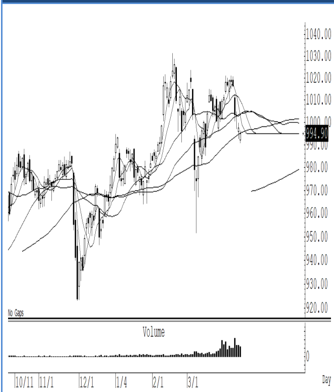
S50M22 (Close 994.90 Chg -2.40)

ย่อตัวลงไปแถว ๆ 991 จุด ก่อนที่จะฟื้นตัวขึ้นมาในช่วงท้ายตลาด สั้น ๆ ไม่ต่ำกว่าแถว ๆ 991 จุด แนะนำ trading ในกรอบระหว่าง 991-1,008 จุด รับรู้กำไร ในกรณีที่ปิดต่ำกว่า 990 จุด แนะนำ ถือ short