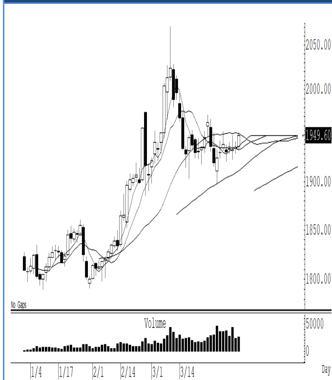
GOM22 (Close 1,949.60 Chg 12.30)

ราคาทองคำโลกฟื้นตัว แต่ยังไม่ข้ามแถว ๆ 1,950 ดอลลาร์ สั้น ๆ ไม่ข้าม 1,950 ดอลลาร์ แนะนำ trading ในกรอบแถว ๆ 1,950-1,920 ระวังกำไร ในกรณีที่บีตต่ำกว่า 1,905 ดอลลาร์ แนะนำ ถือ short หวังผลปรับตัวลงไปแถว ๆ 1,850 ดอลลาร์ ระวังกำไร