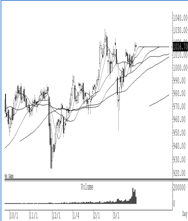
S50M22 (Close 1,016.70 Chg -1.40)