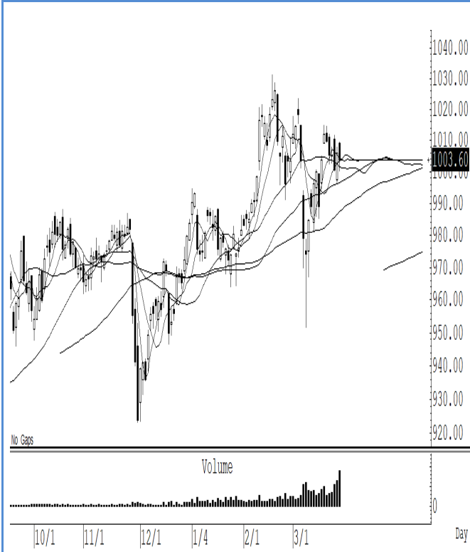
S50M22 (Close 1,003.60 Chg 5.50)

ยังคงแกว่งตัวขึ้น ๆ ลง ๆ สลับกันไป แนวโน้มเรคาคดยังไร้ทิศทางที่ชัดเจน แต่มีจุด stop ขาขึ้นที่ 995 จุด สั้น ๆ ไม่ต่ำกว่าแนวรับแถว ๆ 997 จุด แนะนำ trading ในกรอบ 997-1,011 จุด รับรู้กำไร