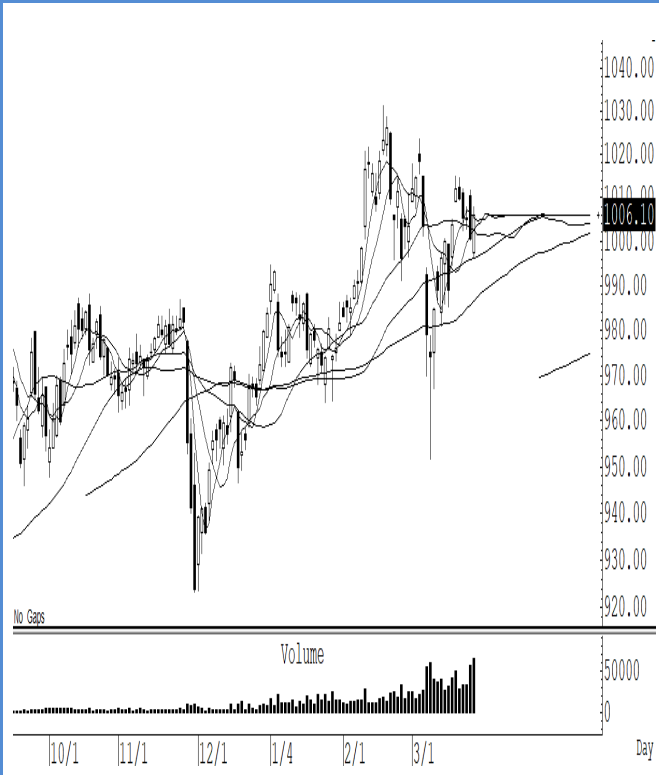
S50M22 (Close 1,006.10 Chg 5.50)