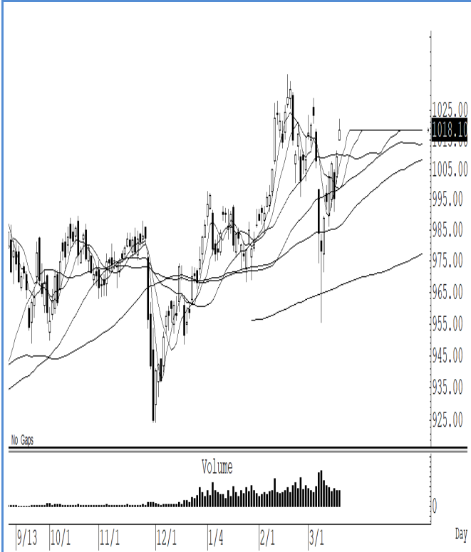
S50H22 (Close 1,018.10 Chg 8.80)

ปรับตัวขึ้นแบบค่อยเป็นค่อยไป ทิศทางยังคงคาดว่าน่าจะแกว่งตัวขึ้นต่อ สั้น ๆ ไม่ต่ำกว่าแนวรับแถว ๆ 1,009 จุด แนะนำ trading ในกรอบ 1,009-1,028 จุด รับรู้กำไร