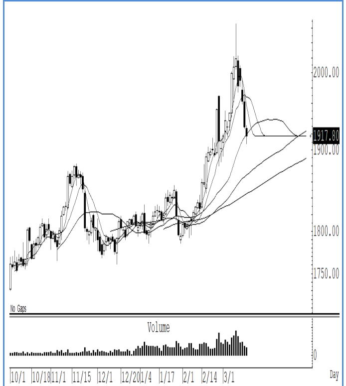
GOH22 (Close 1,917.80 Chg -11.30)

ราคาทองคำโลกย่อตัวลงมาต่อเนื่อง สั้น ๆ ดิดกลับไม่ข้ามแถว ๆ 1,940 ดอลลาร์ แนะนำ trading ในกรอบแถว ๆ 1,940-1,900 รับรู้กำไร ในกรณีที่ปิดต่ำกว่า 1,900 ดอลลาร์ แนะนำ ถือ short หวังผลปรับตัวลงไปแถว ๆ 1,880 ดอลลาร์ รับรู้กำไร