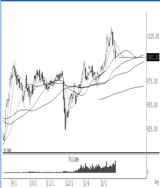
S50H22 (Close 1,001.50 Chg 6.90)