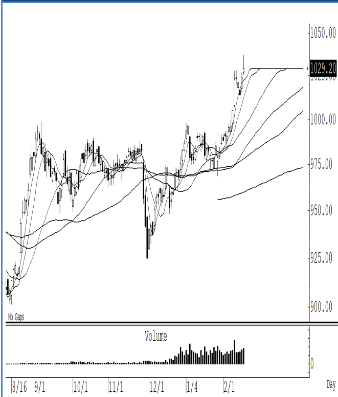
S50H22 (Close 1,029.20 Chg 4.90)