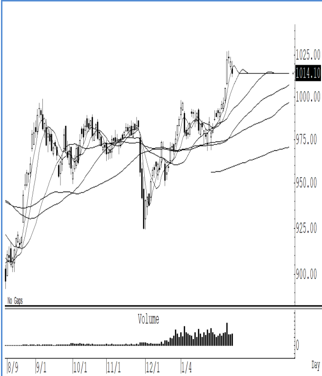
S50H22 (Close 1,014.10 Chg -7.0)

ย่อตัวลงมาน้อยกว่าที่คาด สั้น ๆ ดึงกลับไม่ข้ามแนว ๆ 1,020-1,023 จุด คาดว่าน่าจะมีการย่อตัวลงต่อ แนะนำ trading ในกรอบ 1,023-1,003 จุด ระวังกำไร