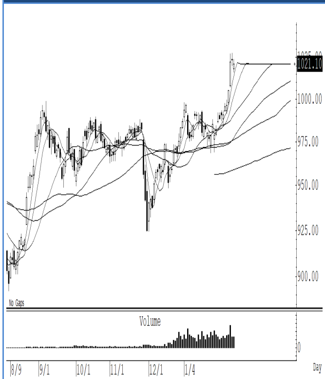
S50H22 (Close 1,021.10 Chg -2.70)

ย่อตัวลงมาน้อยกว่าที่คาด สั้น ๆ ไม่ข้ามแถว ๆ 1,027-1,031 จุด คาดว่าน่าจะมีการย่อตัวลง แนะนำ trading ในกรอบ 1,027-1,008 จุด ระวังกำไร