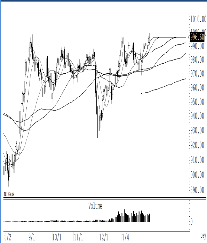
S50H22 (Close 995.70 Chg 5.00)