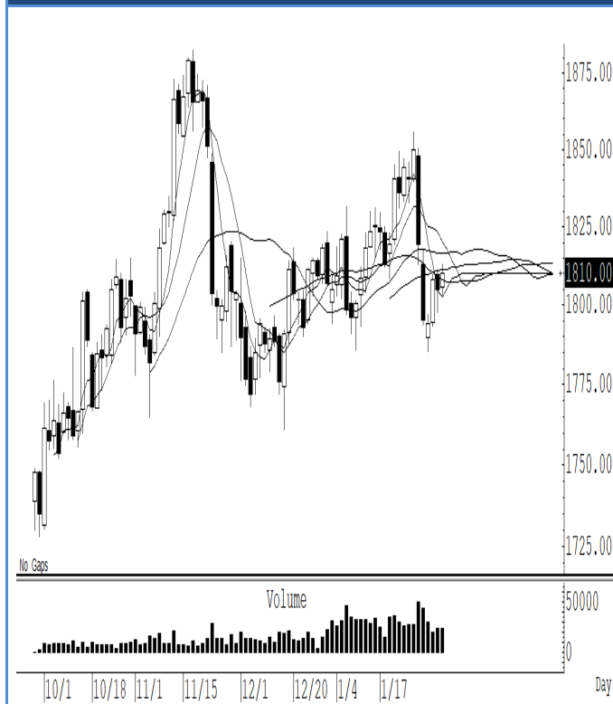
GOH22 (Close 1,810.00 Chg 5.0)

ราคาทองคำโลกแกว่ง sideway up สั้น ๆ ไม่ต่ำกว่าแนวรับ 1,790 ดอลลาร์ แนะนำ trading ในกรอบแถว ๆ 1,790-1,830 ระวังกำไร ในกรณีที่ปิดต่ำกว่า 1,780 ดอลลาร์ แนะนำ ถือ short หวังผลปรับตัวลงไปแถว ๆ 1,750 ดอลลาร์ ระวังกำไร