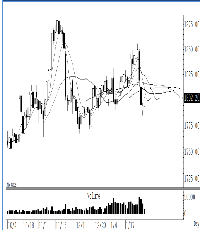
GOH22 (Close 1,802.20 Chg 8.10)

ราคาทองคำโลกแกว่งตัวออกด้านข้าง ยังมีทิศทางไม่ชัดเจน สั้น ๆ ไม่ต่ำกว่าแนวรับ 1,780 ดอลลาร์ แนะนำ trading ในกรอบแถว ๆ 1,780-1,815 ระวังกำไร ในกรณีที่ปิดต่ำกว่า 1,780 ดอลลาร์ แนะนำ ถือ short หวังผลปรับตัวลงไปแถว ๆ 1,750 ดอลลาร์ ระวังกำไร