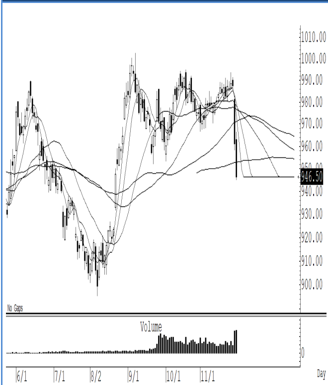
S50Z21 (Close 946.50 Chg -14.60)

ปรับตัวลงใกล้เคียงกับที่คาด เรายังมองผันผวนอยู่ แต่วันนี้มีลูนิตดิ่งสั้น ๆ ไม่ต่ำกว่าแนวรับแถว ๆ 943-939 จุด แนะนำ trading long หวังผลดีตกกลับได้ในกรอบแถว ๆ 964 จุด รับรู้กำไร