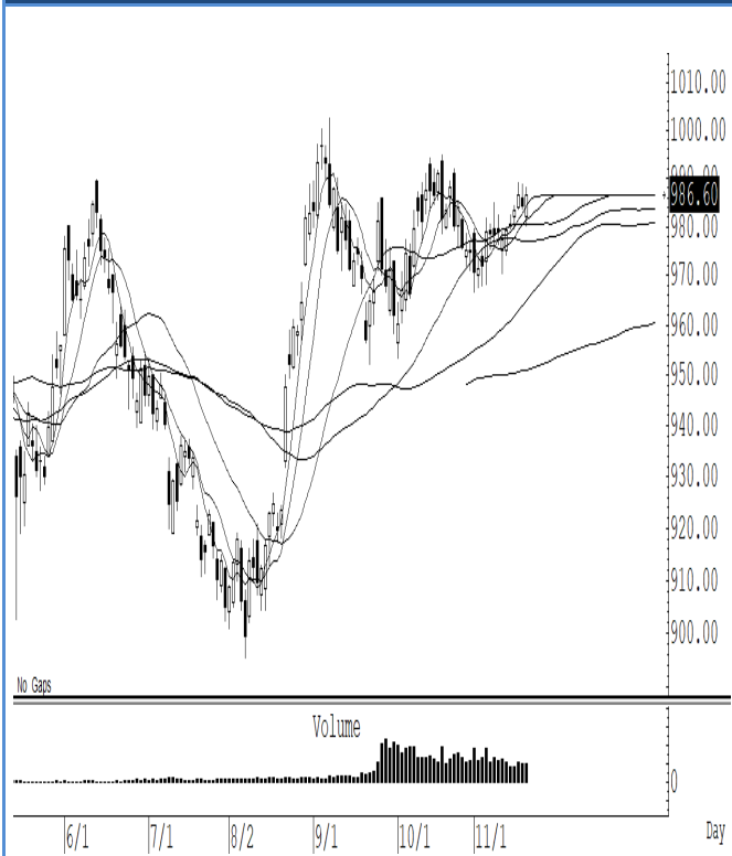
S50Z21 (Close 986.60 Chg 2.40)

ยังคงแกว่งในกรอบตามคาด รอสัญญาณ breakout ออกจากกรอบ สั้น ๆ ไม่ต่ำกว่าแนวรับแถว ๆ 982 จุด แนะนำ trading ในกรอบระหว่าง 982-994 จุด รับรู้กำไร