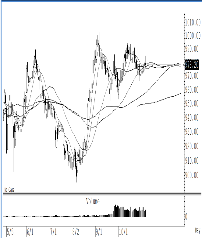
S50Z21 (Close 978.20 Chg -0.40)

แกว่งออกด้านข้าง ยังไม่มีทิศทางที่ชัดเจน สั้น ๆ ไม่ต่ำกว่าแนวรับแถว ๆ 974 จุด แนะนำ trading ในกรอบระหว่าง 974-986 จุด รับรู้กำไร