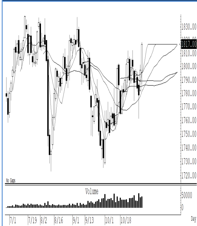
GOZ21 (Close 1,817.00 Chg 19.60)

ราคาทองคำโลกฟื้นตัวดีกว่าพอสมควร สั้น ๆ ไม่ต่ำกว่าแถว ๆ 1,800 ดอลลาร์ แนะนำ เปิด long หวังผลปรับตัวขึ้นไปแถว ๆ 1,835 ดอลลาร์ ระวัง กำไร ในกรณีนี้ที่ปิดต่ำกว่า 1,797 ดอลลาร์ แนะนำ ถือ short