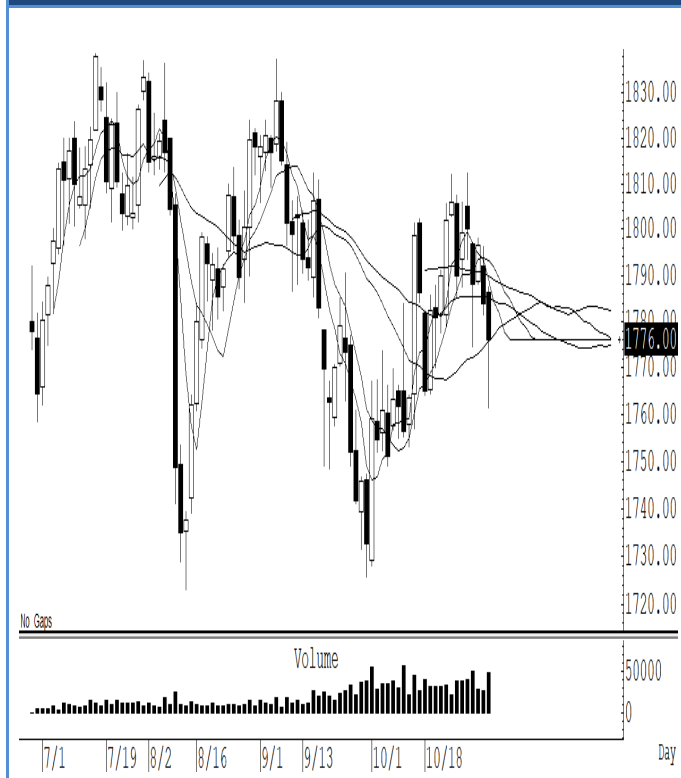
GOZ21 (Close 1,776.00 Chg -8.00)

ราคาทองคำโลกปรับตัวตามคาด สั้น ๆ ดึงกลับไม่ผ่านแถว ๆ 1,790 ดอลลาร์ แนะนำ เปิด short หวังผลปรับตัวลงไปแถว ๆ 1,750 ดอลลาร์ รับรู้กำไร ในกรณีที่ปิดต่ำกว่า 1,750 ดอลลาร์ แนะนำ ถือ short