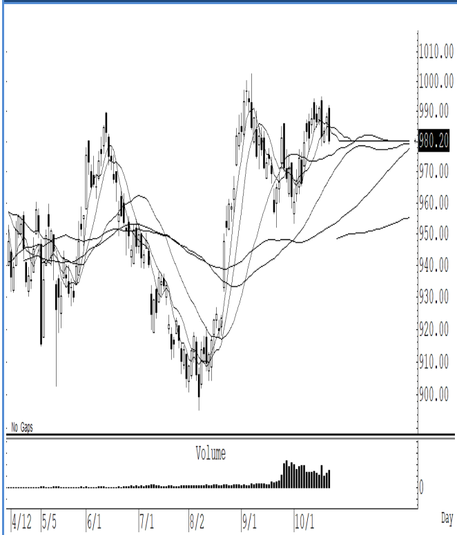
S50Z21 (Close 980.20 Chg -8.00)

กลับมาปรับตัวลงอีกแล้ว เริ่มไม่มีจุดสูงใหม่ แล้วปรับลง ทำให้ดูแนวโน้ม น่าจะซึม ๆ แล้ว สั้น ๆ ไม่ต่ำกว่าแนวรับแถว ๆ 975 จุด แนะนำ trading ในกรอบระหว่าง 975-987 จุด รับรู้กำไร