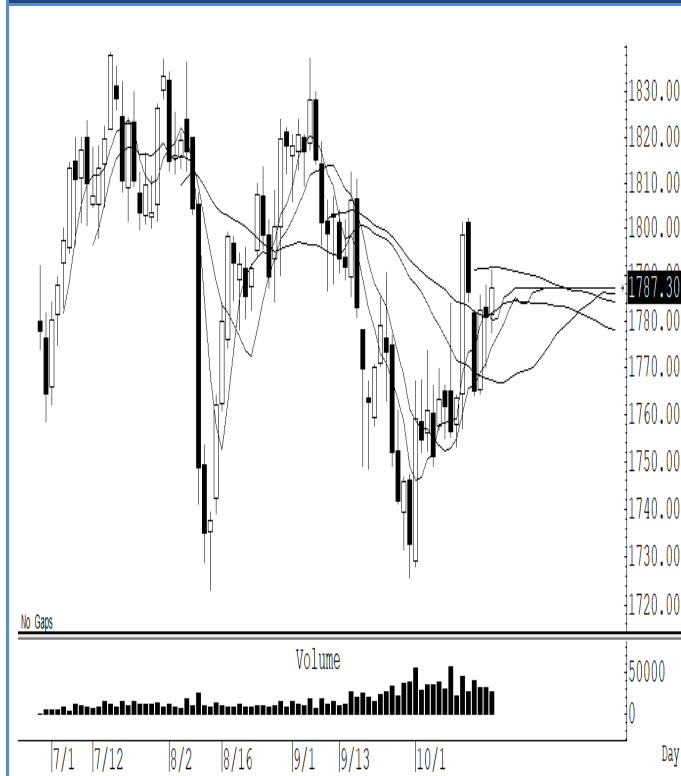
GOZ21 (Close 1,787.30 Chg 6.50)

ราคาทองคำโลกแกว่งออกด้านข้าง สั้น ๆ ไม่ต่ำกว่าแนวรับแถว ๆ 1,770 ดอลลาร์ แนะนำ เปิด long หวังผลปรับขึ้นไปแถว ๆ 1,800 ดอลลาร์ รับรู้กำไร ในกรณีที่ปิดต่ำกว่า 1,755 ดอลลาร์ แนะนำ ถือ short