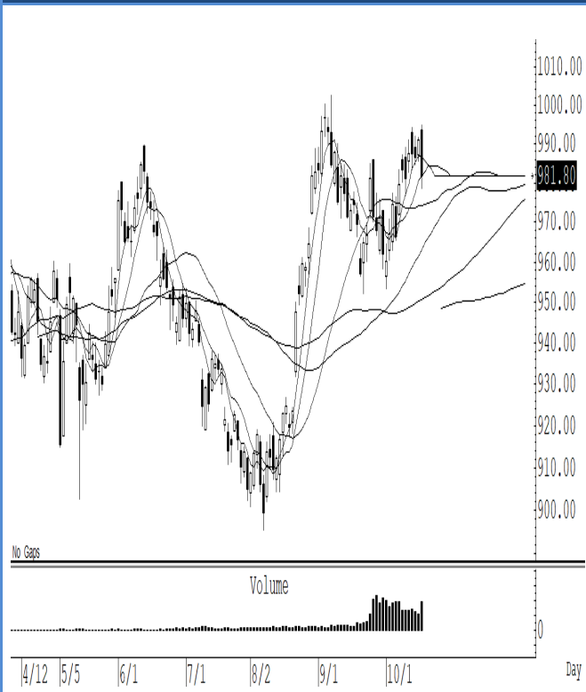
S50Z21 (Close 981.80 Chg -9.10)