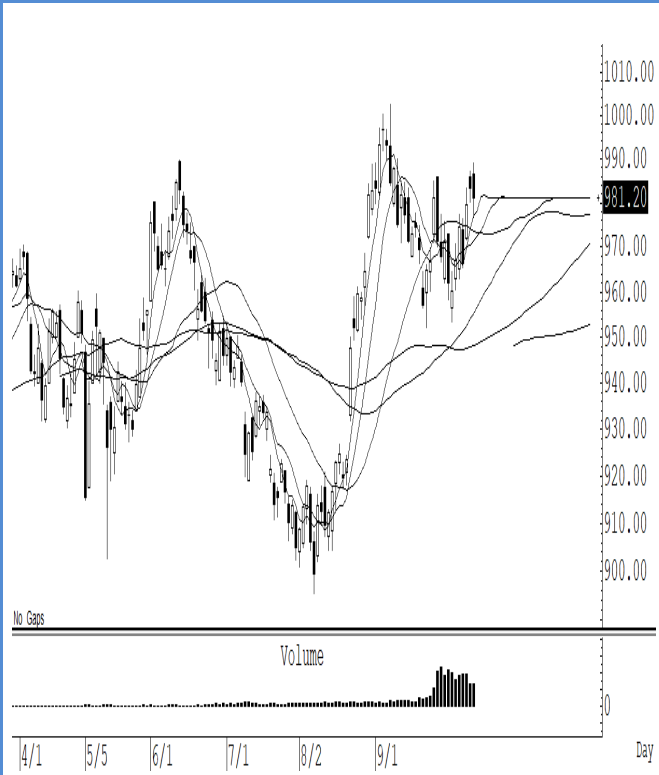
S50Z21 (Close 981.20 Chg -2.00)