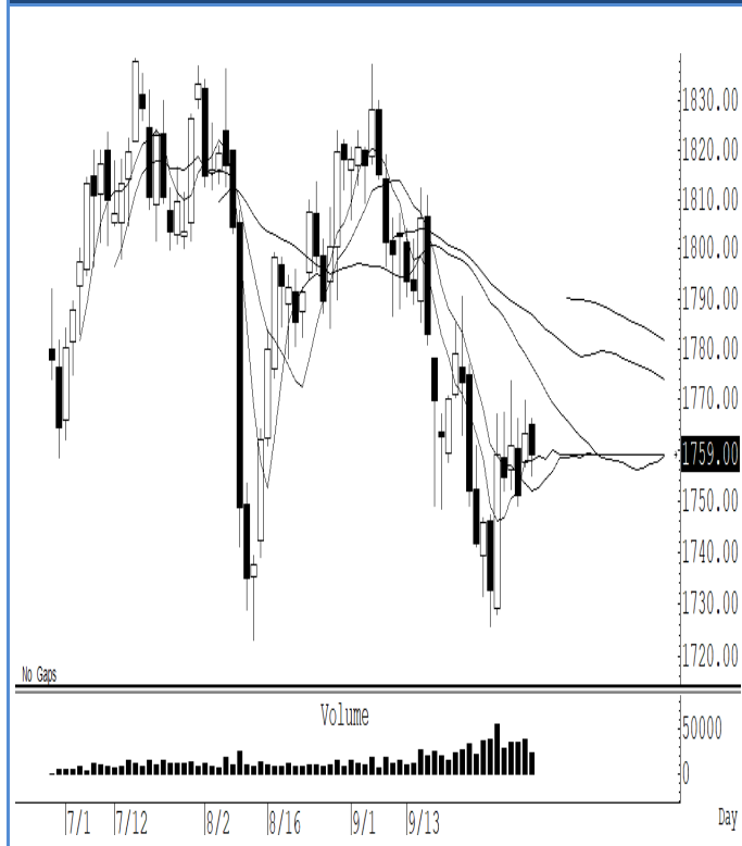
GOZ21 (Close 1,759.0 Chg -4.40)

ราคาทองคำโลกแกว่งออกด้านข้าง ทิศทางยังไม่ชัดเจน สั้น ๆ ไม่ต่ำกว่าแนวรับแถว ๆ 1,750 ดอลลาร์ แนะนำ เก็งกำไร หวังผลดีกลับขึ้นไปแถว ๆ 1,770 ดอลลาร์ รับรู้กำไร ในกรณีที่ปิดต่ำกว่า 1,745 ดอลลาร์ แนะนำ ถือ short