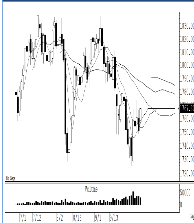
GOZ21 (Close 1,767.80 Chg 16.80)

ราคาทองคำโลกแกว่งออกด้านข้าง สั้น ๆ ไม่ต่ำกว่าแนวรับแถว ๆ 1,745 ดอลลาร์ แนะนำ เก็งกำไร หวังผลดีดกลับขึ้นไปแถว ๆ 1,770 ดอลลาร์ ระวังกำไร ในกรณีนี้ที่ปิดต่ำกว่า 1,740 ดอลลาร์ แนะนำ ถือ short