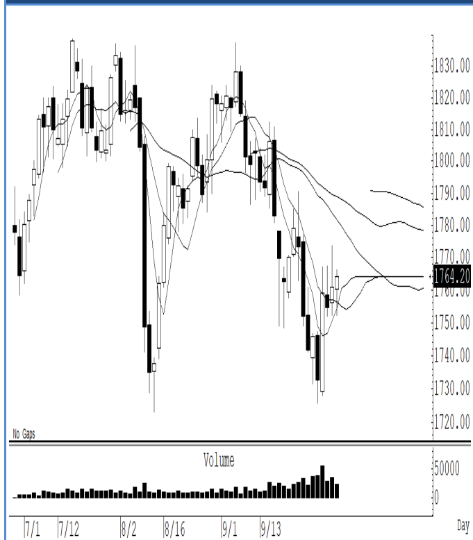
GOZ21 (Close 1,764.20 Chg 3.20)

ราคาทองคำโลกแกว่งออกด้านข้าง สั้น ๆ ไม่ต่ำกว่าแนวรับแถว ๆ 1,747 ดอลลาร์ แนะนำ เก็งกำไร หวังผลดีดกลับขึ้นไปแถว ๆ 1,768 ดอลลาร์ รับรู้กำไร ในกรณีนี้ที่ปิดต่ำกว่า 1,746 ดอลลาร์ แนะนำ ถือ short