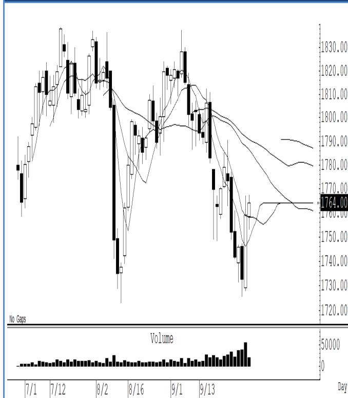
GOZ21 (Close 1,764.00 Chg 5.0)

ราคาทองคำโลกแกว่งออกด้านข้าง สั้น ๆ ไม่ต่ำกว่าแนวรับแถว ๆ 1,750 ดอลลาร์ แนะนำ เก็งกำไร หวังผลดีดกลับขึ้นไปแถว ๆ 1,780 ดอลลาร์ ระวัง กำไร ในกรณีที่มีปิดต่ำกว่า 1,740 ดอลลาร์ แนะนำ ถือ short