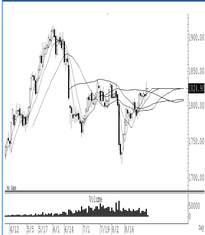
GOU21 (Close 1,824.90 Chg 0.10)

ราคาทองคำโลกแกว่งค่อย ๆ ฟันตัว สั้น ๆ ไม่ต่ำกว่าแนวรับแถว ๆ 1,810 ดอลลาร์ แนะนำ trading ในกรอบระหว่าง 1,810-1,845 ดอลลาร์ ระวังกำไร ในกรณีที่ราคาทองคำปิดต่ำกว่าระดับ 1,805 ดอลลาร์ แนะนำ ถือ short