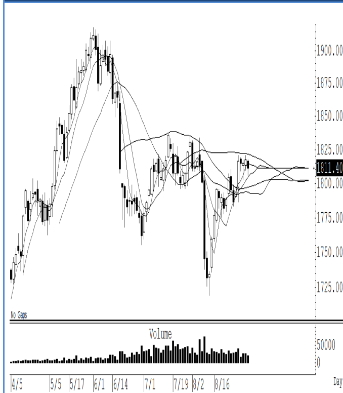
GOU21 (Close 1,811.40 Chg -6.00)

ราคาทองคำโลกแกว่งออกด้านข้าง คาดว่าจะเห็นความชัดเจนภายใน 1-2 วันแล้ว สั้น ๆ ไม่ต่ำกว่าแนวรับแถว ๆ 1,800 ดอลลาร์ แนะนำ trading ในกรอบระหว่าง 1,800-1,850 ดอลลาร์ ระวังถ้าไร ในกรณีที่ราคาทองคำปิดต่ำกว่าระดับ 1,790 ดอลลาร์ แนะนำ ถือ short