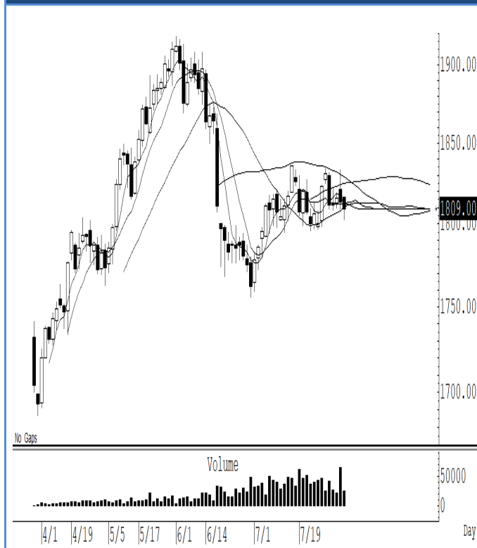
GOU21 (Close 1,809.00 Chg -4.60)

ราคาทองคำโลกแกว่ง sideways ยังไม่มีทิศทางชัดเจน สั้น ๆ ตีกลับไม่ข้ามแถว ๆ 1,820 ดอลลาร์ แนะนำ trading ในกรอบระหว่าง 1,820-1,790 ดอลลาร์ ระวังกำไร ในกรณีที่ปิดต่ำกว่า 1,790 ดอลลาร์ แนะนำ ถือ short หวังผลปรับตัวลงไปแถว ๆ 1,760 ดอลลาร์ ระวังกำไร