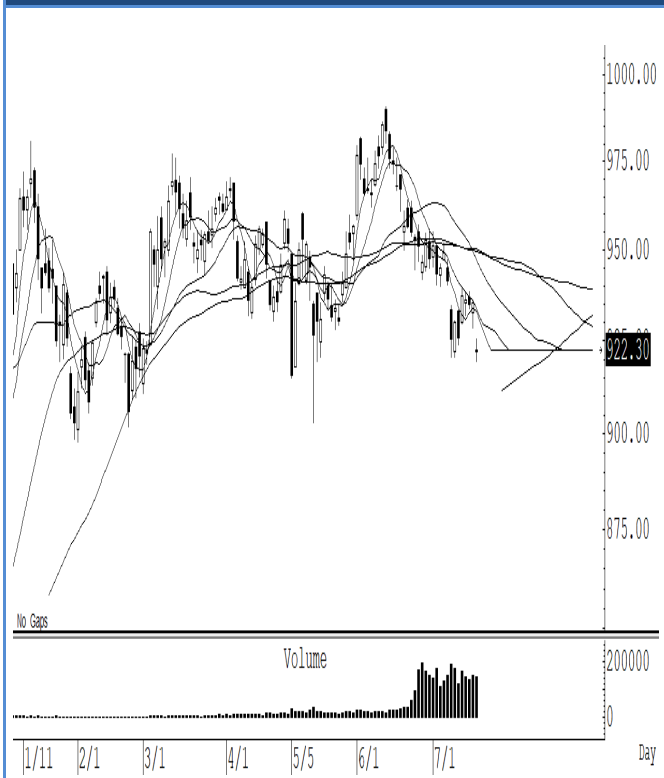
S50U21 (Close 922.30 Chg 0.30)

ปรับตัวลงแรงกว่าที่คาด สั้น ๆ คีดกลับไม่ข้ามแถว ๆ 930 จุด แนะนำ trading ในกรอบระหว่าง 930-902 จุด รับรู้กำไร