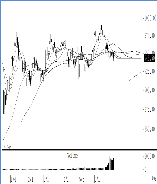
S50U21 (Close 943.50 Chg -7.60)