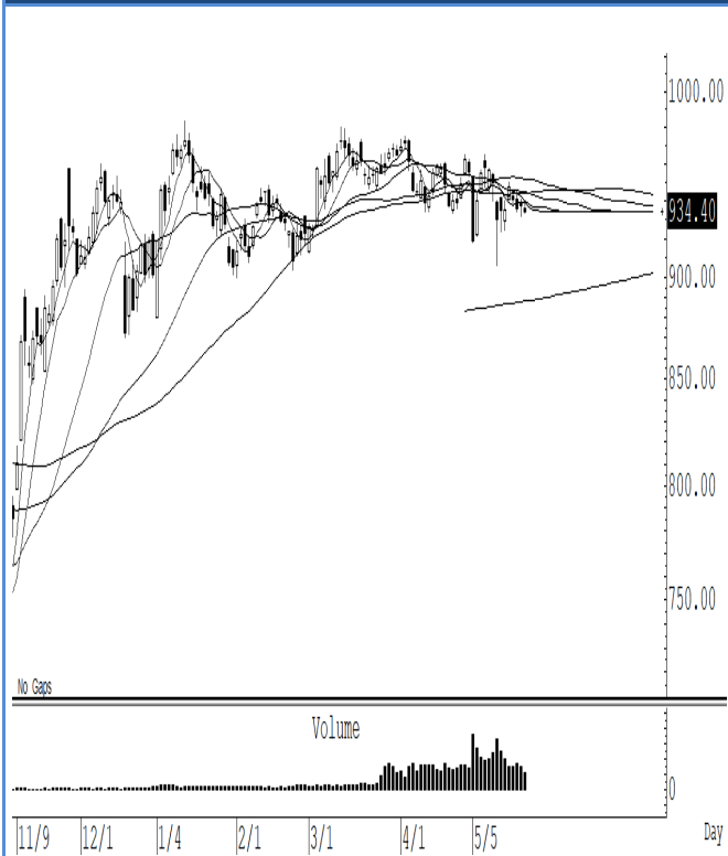
S50M21 (Close 934.40 Chg -3.50)