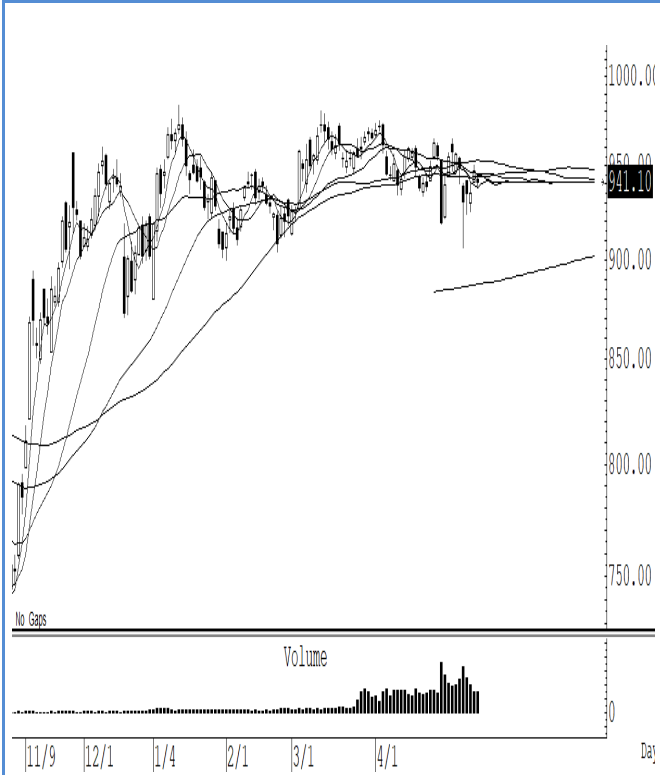
S50M21 (Close 941.10 Chg -6.10)