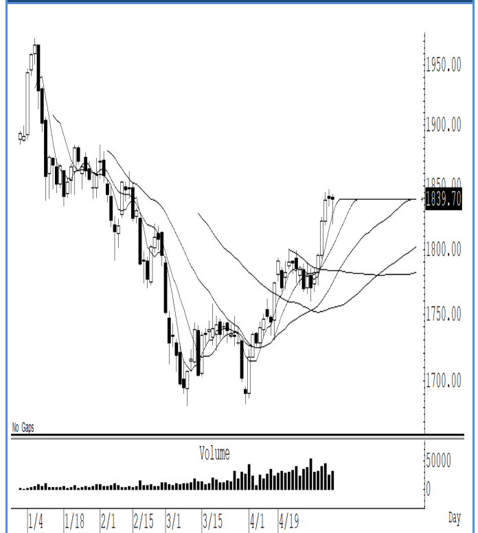
GOM21 (Close 1,839.70 Chg -0.60)

ราคาทองคำปรับลงไปทดสอบระดับ 1,820 ดอลลาร์แล้วดีดกลับขึ้นมาได้ตามคาด วันนี้ไม่ต่ำกว่าแนวรับแถว ๆ 1,820 ดอลลาร์อีก น่าจะมีหุ้นดีดกลับต่อ แนะนำ trading ในกรอบ 1,820-1,850 ระวังกำไร ในกรณีที่ปิดเหนือระดับ 1,850 ดอลลาร์ได้ แนะนำ ถึง long ต่อ