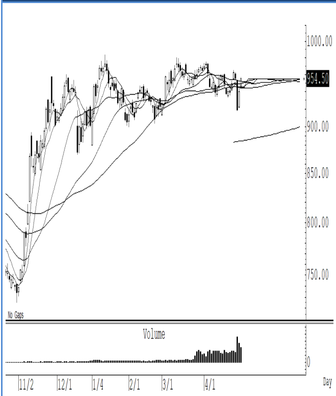
S50M21 (Close 954.50 Chg 14.70)