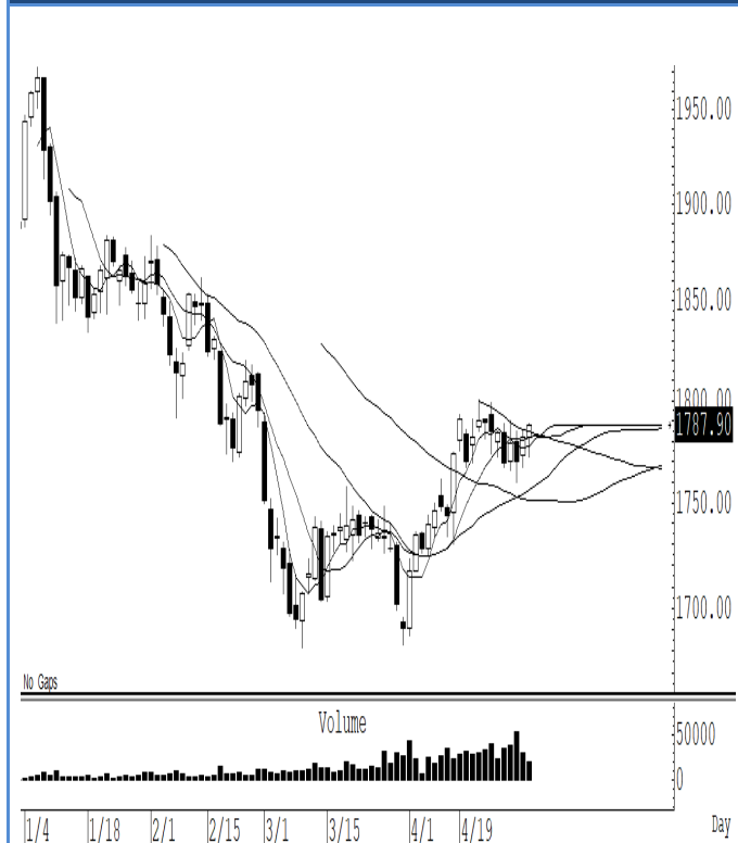
GOM21 (Close 1,787.90 Chg 6.20)

ราคาทองคำยังคงแกว่งตัวออกด้านข้าง แบบไร้ทิศทาง สั้น ๆ คาดว่าน่าจะแกว่งในกรอบแคบ เพื่อรอสัญญาณ breakout แนะนำ trading ในกรอบ 1,765-1,800 รับรู้กำไร ปิดเหนือ 1,800 ดอลลาร์ได้ แนะนำถือ long