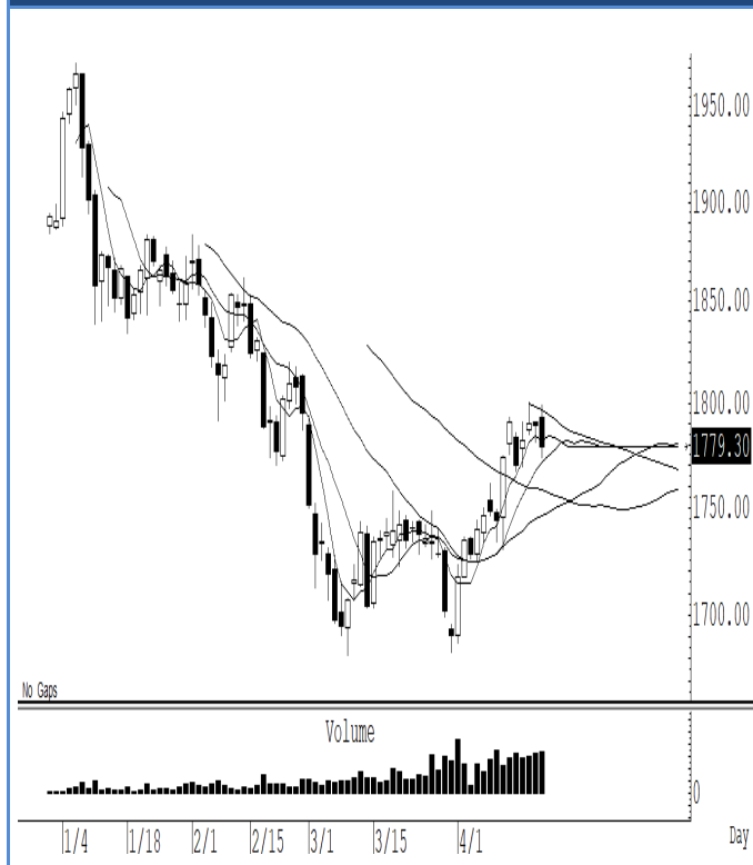
GOM21 (Close 1,779.30 Chg -10.20)

ราคาทองกันแกว่งตัวออกด้านข้าง สั้น ๆ ไม่ต่ำกว่าแนวรับแถว ๆ 1,765 ดอลลาร์ มีลุ้นไปต่อแถว ๆ 1,815 ดอลลาร์ แนะนำ trading ในกรอบ 1,765-1,815 ระวังกำไร