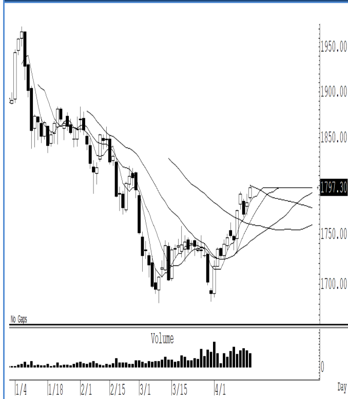
GOM21 (Close 1,797.30 Chg 15.20)

ราคาทองคำฟื้นตัวต่อ สั้น ๆ ไม่ต่ำกว่าแนวรับแถว ๆ 1,780 ดอลลาร์ มีลุ้นไปต่อ แนะนำ trading ในกรอบ 1,780-1,815 ระวังกำไร