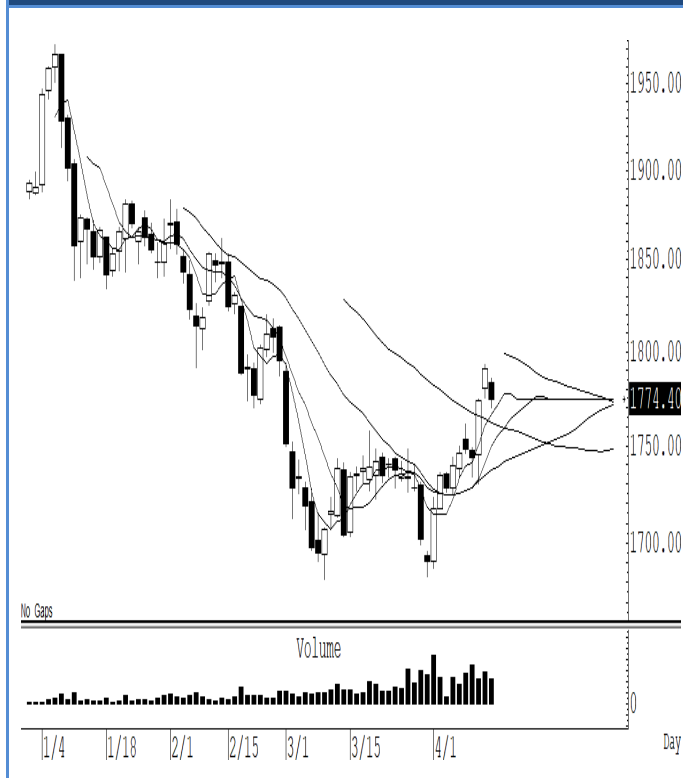
GOM21 (Close 1,774.40 Chg -16.70)

ราคาทองคำขยับตัวกลับลงมาจากแรงขายทำกำไรในระยะสั้น สั้น ๆ ไม่ข้ามแถว ๆ 1,780 ดอลลาร์ คาดว่าจะขยับตัวลงในระยะสั้น แนะนำ trading ในกรอบ 1,780-1,755 รับรู้กำไร