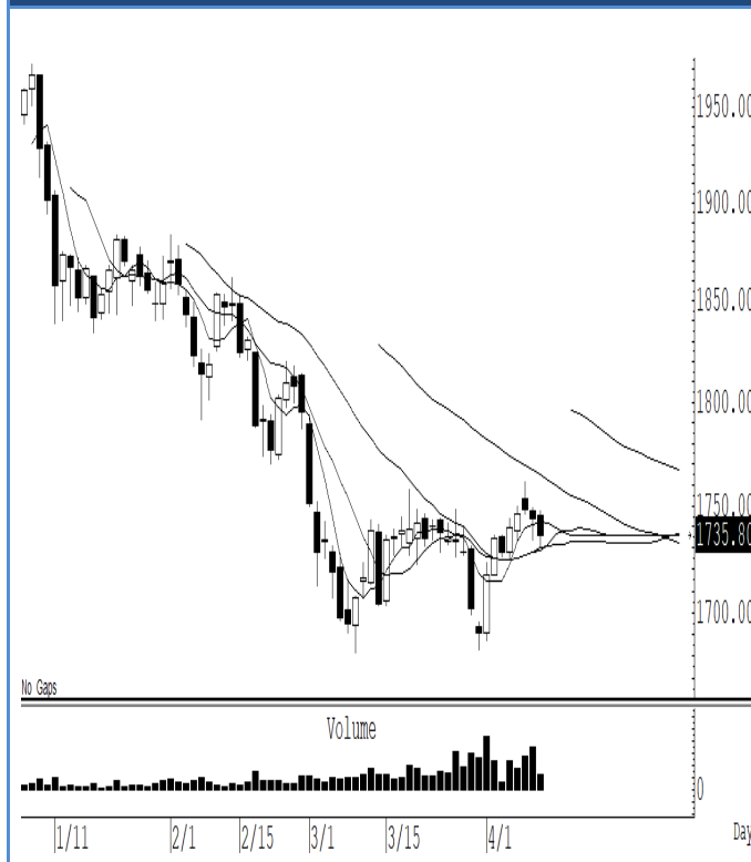
GOM21 (Close 1,735.80 Chg -8.20)

ราคาทองคำฟื้นตัวขึ้นไปใกล้เคียงกับที่คาด มีลุ้นฟื้นตัวต่อ แต่สั้น ๆ อาจมี แกว่งไม่ต่ำกว่าแนวรับแถว ๆ 1,745 ดอลลาร์ แนะนำ trading ในกรอบ 1,745-1,780 รับรู้กำไร