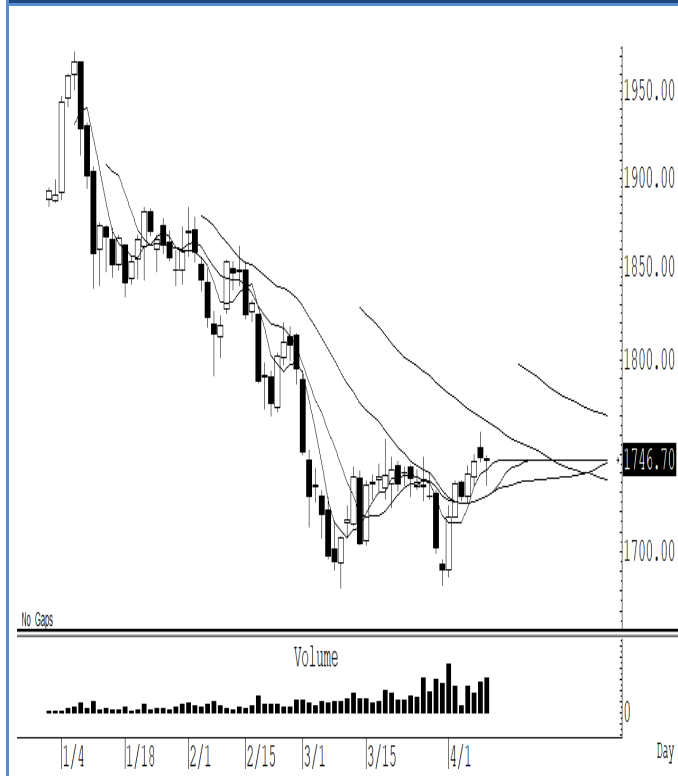
GOM21 (Close 1,746.70 Chg -1.60)

ราคาทองคำย่อดึงกลับลงมามากครั้ง สั้น ๆ ไม่ต่ำกว่าแนวรับแถว ๆ 1,730 ดอลลาร์ แนะนำ trading ในกรอบ 1,730-1,760 ระวังกำไร