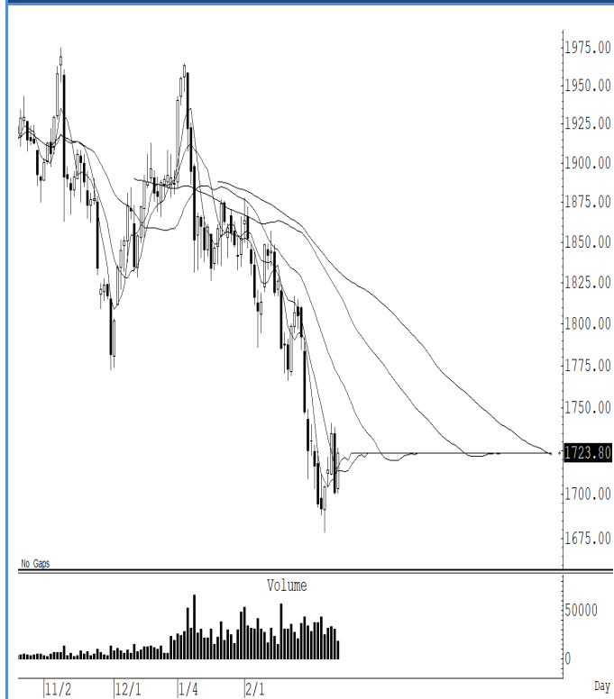
GOH21 (Close 1,723.80 Chg 22.70)

ราคาทองคำเริ่มพักตัว สั้น ๆ ไม่ต่ำกว่าแนวรับ 1,710 ดอลลาร์ จะมีลุ้นดีด กลับขึ้นไปแถว ๆ 1,770 ดอลลาร์ แนะนำ trading ในกรอบ 1,710-1,770 รับรู้กำไร ในกรณีที่ปิดต่ำกว่าระดับ 1,700 ดอลลาร์ แนะนำ ถือ short