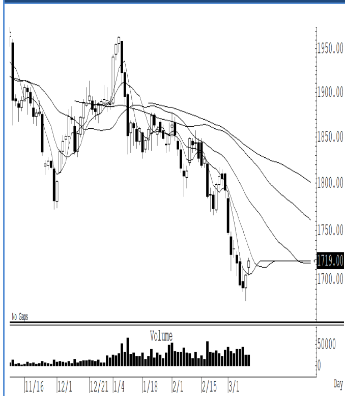
GOH21 (Close 1,719.00 Chg 14.80)

ราคาทองคำฟื้นตัวตามคาด หลังไม่ต่ำกว่าแนวรับแถว ๆ 1,670 ดอลลาร์ สั้น ๆ ไม่ต่ำกว่าแนวรับ 1,720 ดอลลาร์ จะมีลูนด์ติดกลับขึ้นไปแถว ๆ 1,770 ดอลลาร์ แนะนำ trading ในกรอบ 1,720-1,770 ระวังกำไร