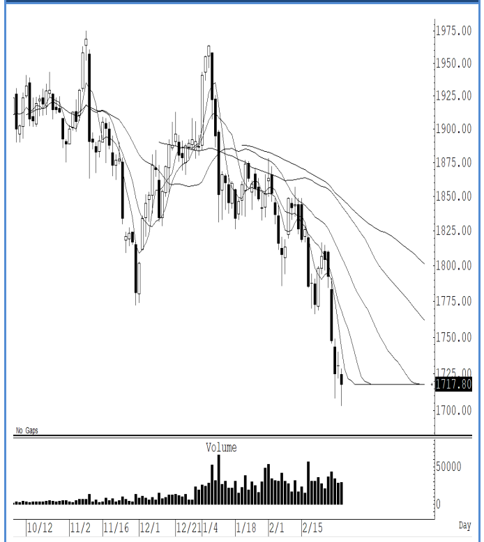
GOH21 (Close 1,717.80 Chg -12.90)

ราคาทองคำแกว่งออกด้านข้าง และยังมีทิศทางที่ไม่ชัดเจน ไม่ต่ำกว่าแนวรับ แถว ๆ 1,700 ดอลลาร์ แนะนำ trading ในกรอบ 1,700-1,750 ระวังกำไร ในกรณีที่ปิดต่ำกว่า 1,700 แนะนำ ถือ short