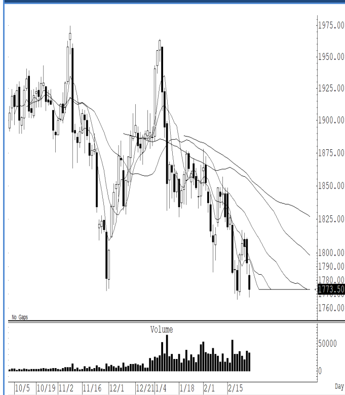
GOH21 (Close 1,773.50 Chg -19.00)

ราคาทองคำปรับตัวลงแรง และปรับตัวลงมาทดสอบแนวรับสำคัญแถว ๆ 1,710 จุด ก่อนที่จะแกว่งตัวออกด้านข้าง สั้น ๆ ไม่ต่ำกว่าแนวรับแถว ๆ 1,720 ดอลลาร์ แนะนำ trading ในกรอบ 1,720-1,770 ระวังกำไร ในกรณีที่ ปิดต่ำกว่า 1,700 แนะนำ ถือ short