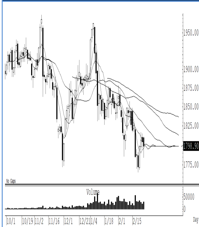
GOH21 (Close 1,798.90 Chg -5.90)

ราคาทองคำแกว่งตัวออกด้านข้าง ยังไม่มีทิศทางที่ชัดเจน คาดว่าจะแกว่งใน กรอบระหว่าง 1,780-1,830 ดอลลาร์ แนะนำ trading ในกรอบดังกล่าว ใน กรณีที่ปิดต่ำกว่า 1,780 แนะนำ ถือ short