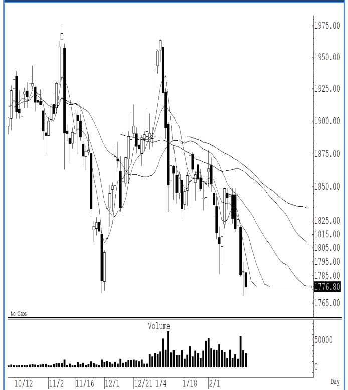
GOH21 (Close 1,776.80 Chg -10.80)

ราคาทองคำปรับตัวลงต่อเนื่อง หลังปิดต่ำกว่าแถว ๆ 1,810 ดอลลาร์ ส่งผลให้ระยะกลางเริ่มดูอ่อนลง แนะนำ trading ในกรอบระหว่าง 1,785-1,720 ดอลลาร์ รับรู้กำไร ในกรณีที่ปิดต่ำกว่า 1,715 แนะนำ ถือ short